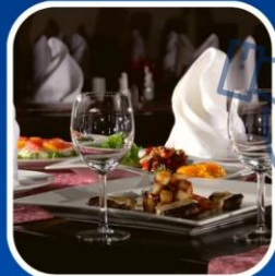
cocktail hour and a full meal provided by Moose on the Loose Catering

Purchase tickets at www.fcme.org/events-at-fcme OR scan QR code