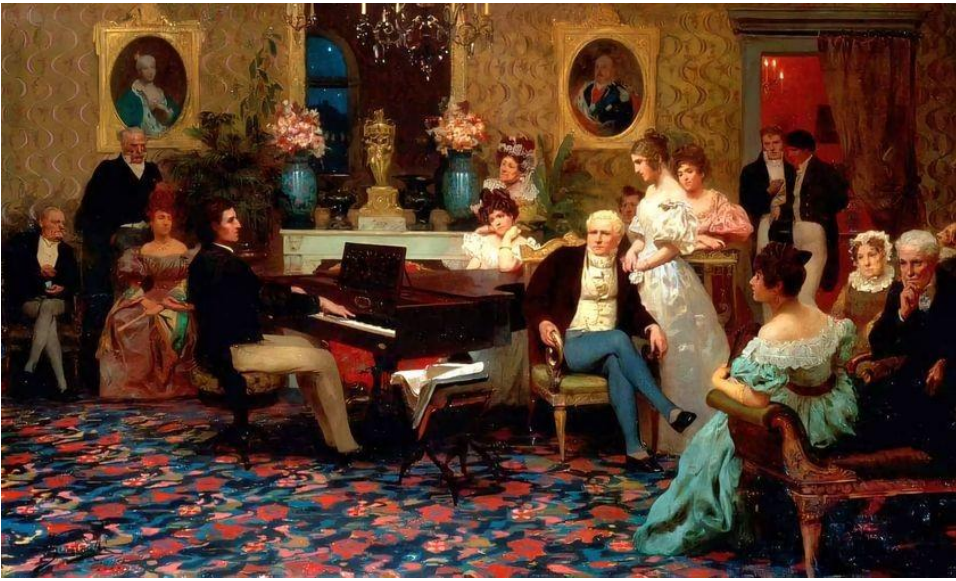
Frédéric François Chopin (March 1810 – 17 October 1849)

Chopin played the piano in the dark throughout his entire life. He would always put out the candles in the room, and even when playing at an event or party, he would ask to extinguish the light in the room. He was shy, and only gave around thirty public concerts in his lifetime; he preferred to play at small gatherings in the salons of wealthy Parisians.