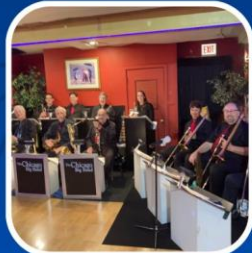
Chicago Big Band live entertainment