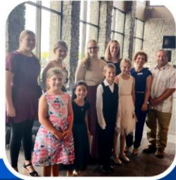
performance by students (and their parents!) of the Conservatory