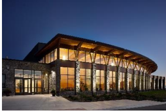
Manitowoc Location Music for Tots™ Holy Family Conservatory 6751 Calumet Ave. Manitowoc, WI 54220