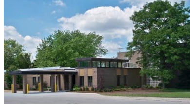
Sheboygan Location Music for Tots™ Ebenezer U.C.C. 3215 Saemann Ave. Sheboygan, WI 53081