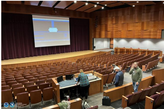
Prepping Endries Hall prior to event