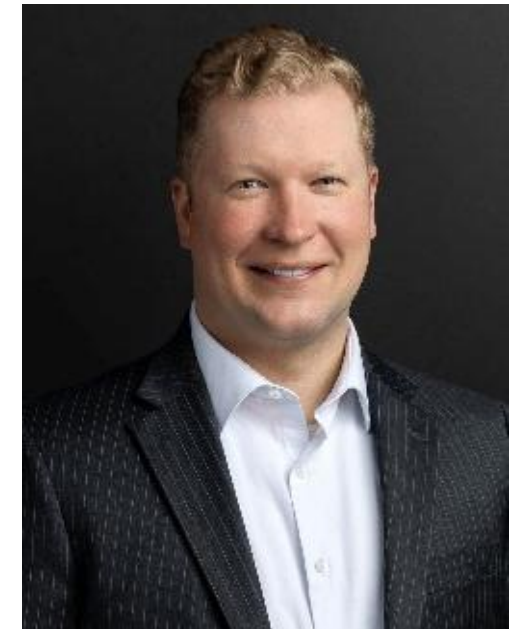
Mayor Justin Nickels